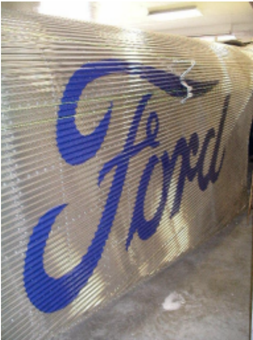
Fuselage, looking toward the rear