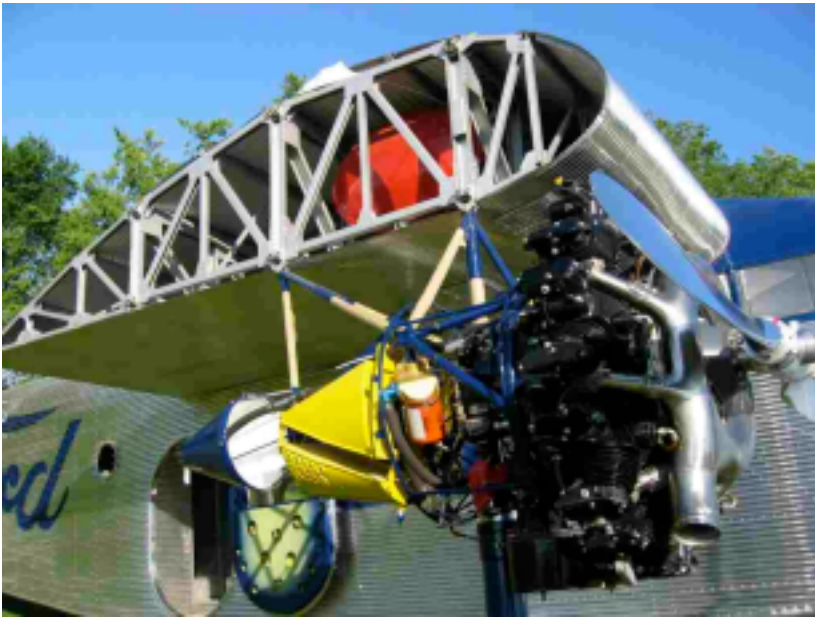
A better look at the center section and right engine mounted.