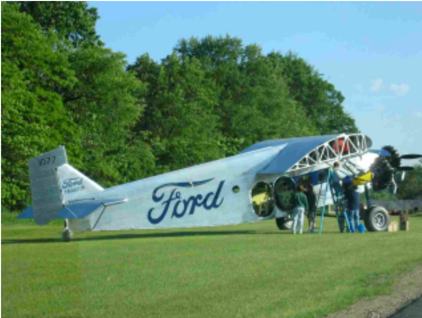
1077 was taken outside in May for further rigging work