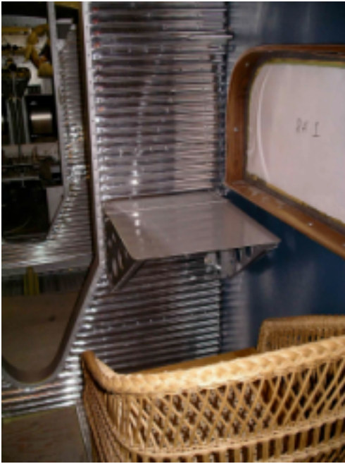
This ship has one fold out writing desk and wicker chairs.