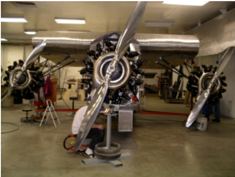
Checking the engine mounts