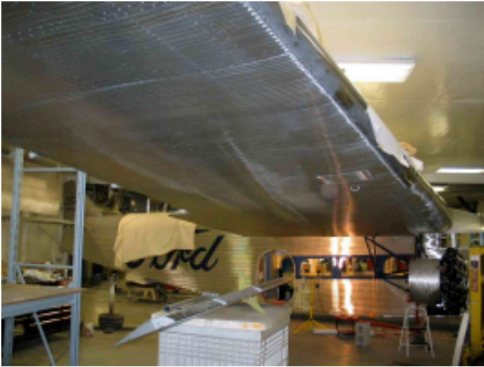
The wing mounted on the fuselage. Roof height precludes having the ship on wheels in this particular facility.